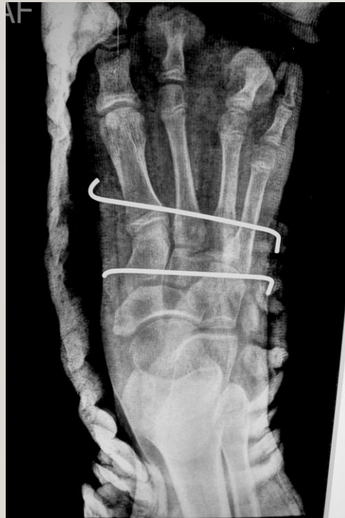
Immediate post-op X-ray