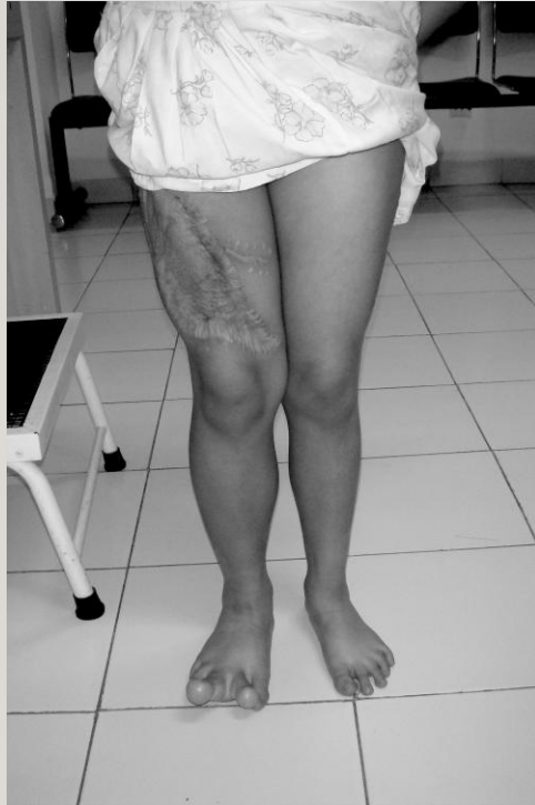
Old burn over thigh treated elsewhere