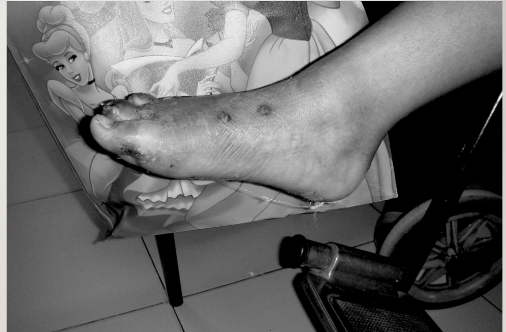
1 month post-op