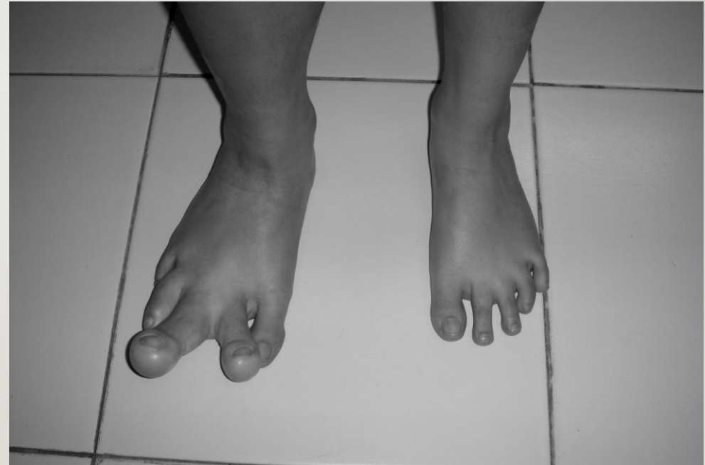
2 nd & 3 rd toes mainly involved Splaying of foot