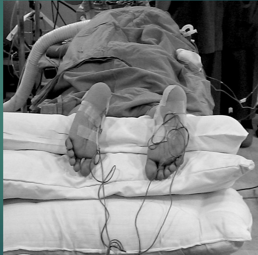
Spinal cord monitoring